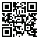
Farm Progress Video